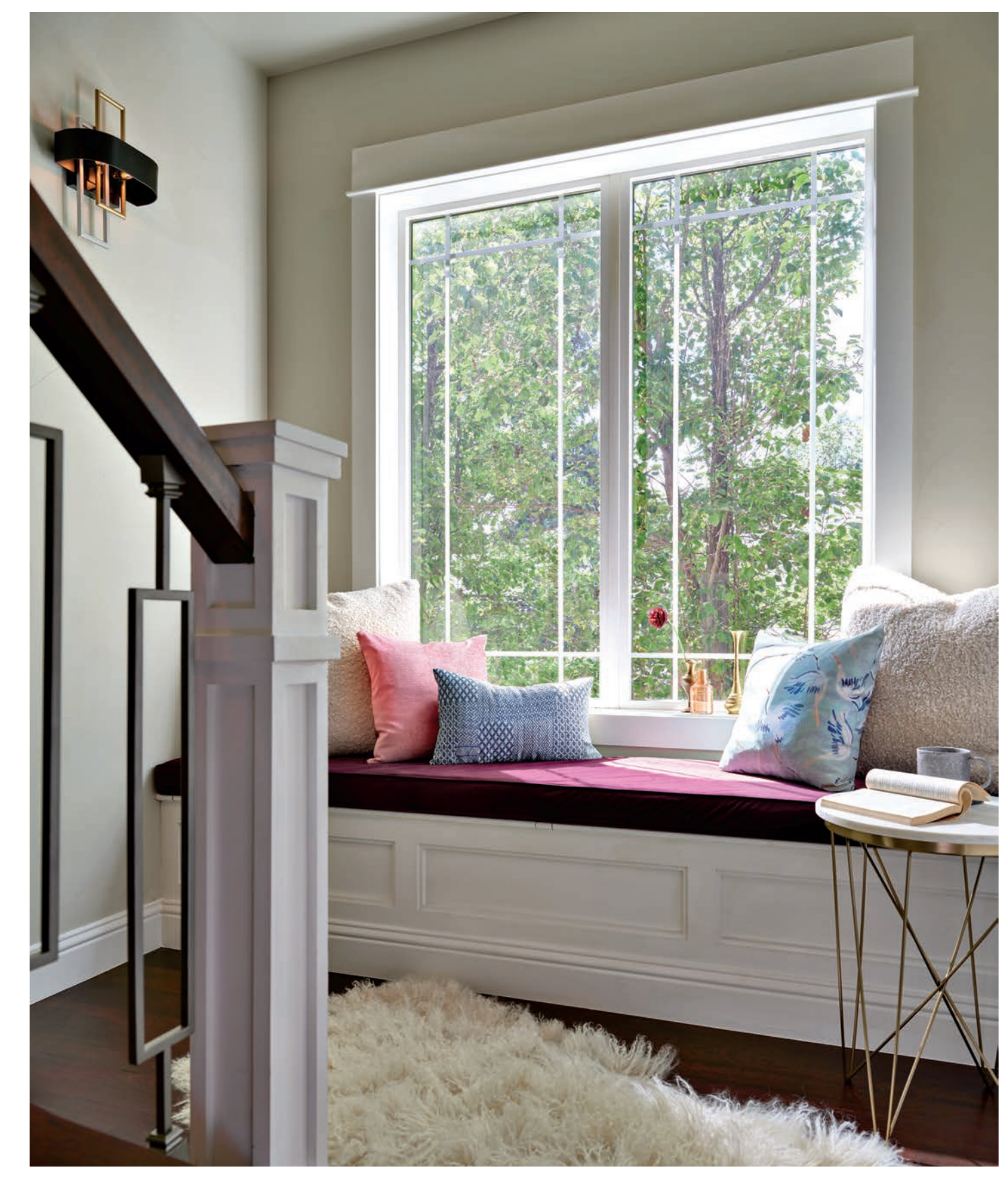
Designer Rydhima Brar recast a nondescript window seat into an inviting perch with a vibrant custom wine-colored cushion, a variety of textured and patterned pillows and a cushy sheepskin rug. The sconce is by Progress Lighting.

Speaking of things her clients had initially disliked, the kitchen's hulking hood disappeared entirely under Brar's watch, swapped out with a streamlined ceiling-mount model. "That made such a big difference from both a design and functionality perspective," the designer says with satisfaction. Suffice it to say, in every space, this is a design story with a happy ending.