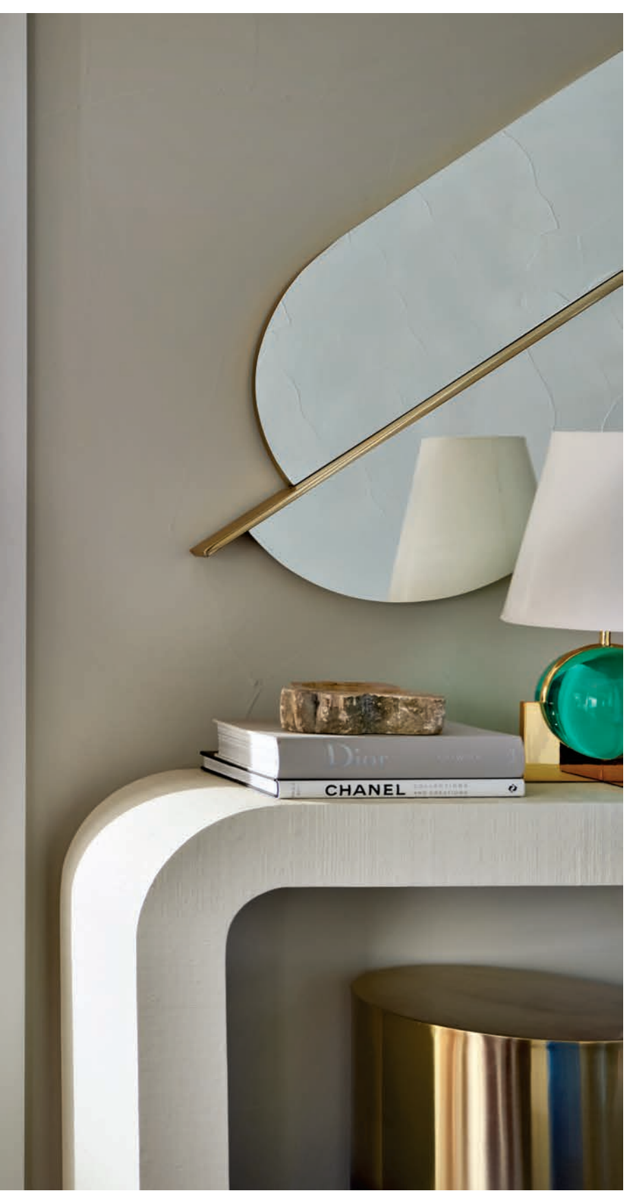
In the sunny study, a marble accent table by CB2 sits atop a Denver Rug Company rug opposite an RH desk. Outside the French doors stand a lacquered linen console and mirror, both also CB2. The artwork is Patrick Semple.